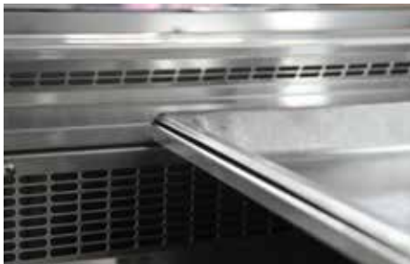
Cold air is blown above and below the produce