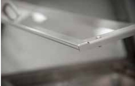
Display doors also act as sneeze guards

The self serve unit is supplied with the Woodson smart design gantry. The display doors on both sides simply lift up and lock into position acting as sneeze guards