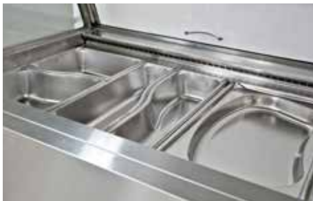
Optional pan combinations